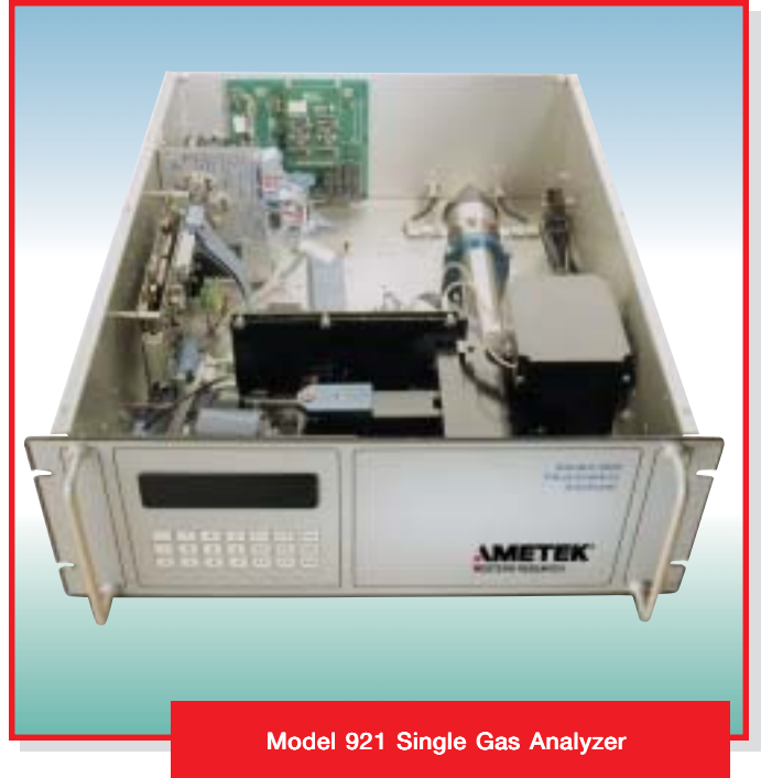
Model 921 Single Gas Analyzer

Resolution better than 0.02 nm is provided by high intensity, line source lamps. These sources emit at a fixed wavelength, providing great measurement stability, and emit low total power, removing the potential for sample photolysis. The high resolution enables unparalleled linearity over a wide dynamic range (less than 1% deviation over 4 to 5 orders of magnitude) which, in turn, leads to simple, robust data analysis.